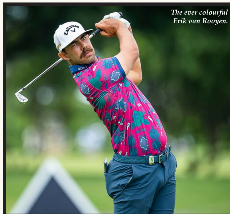
The ever colourful Erik van Rooyen.