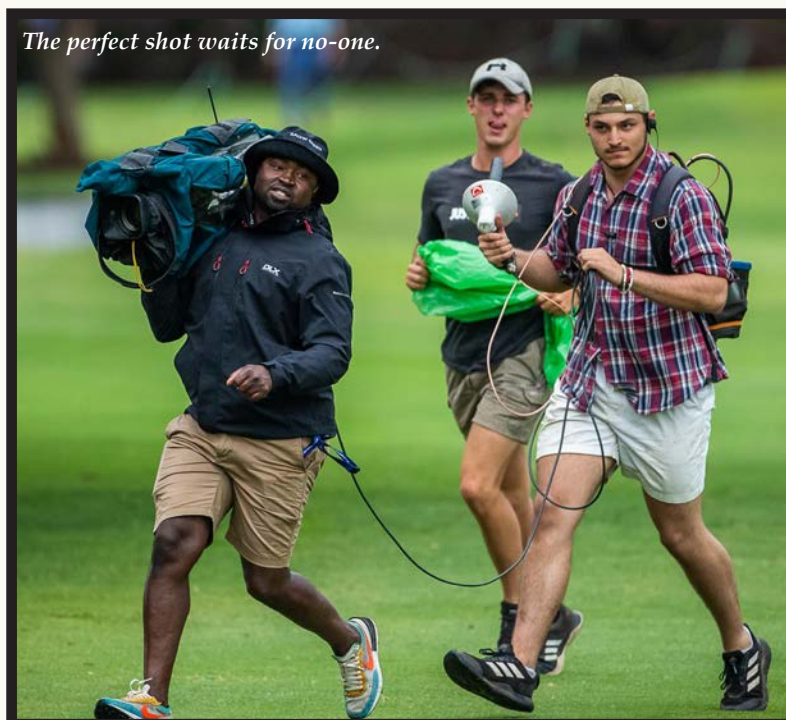
The perfect shot waits for no-one.