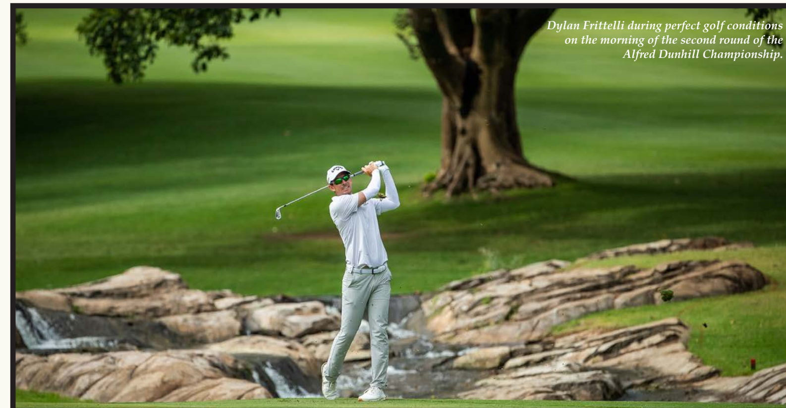
Dylan Frittelli during perfect golf conditions on the morning of the second round of the Alfred Dunhill Championship.