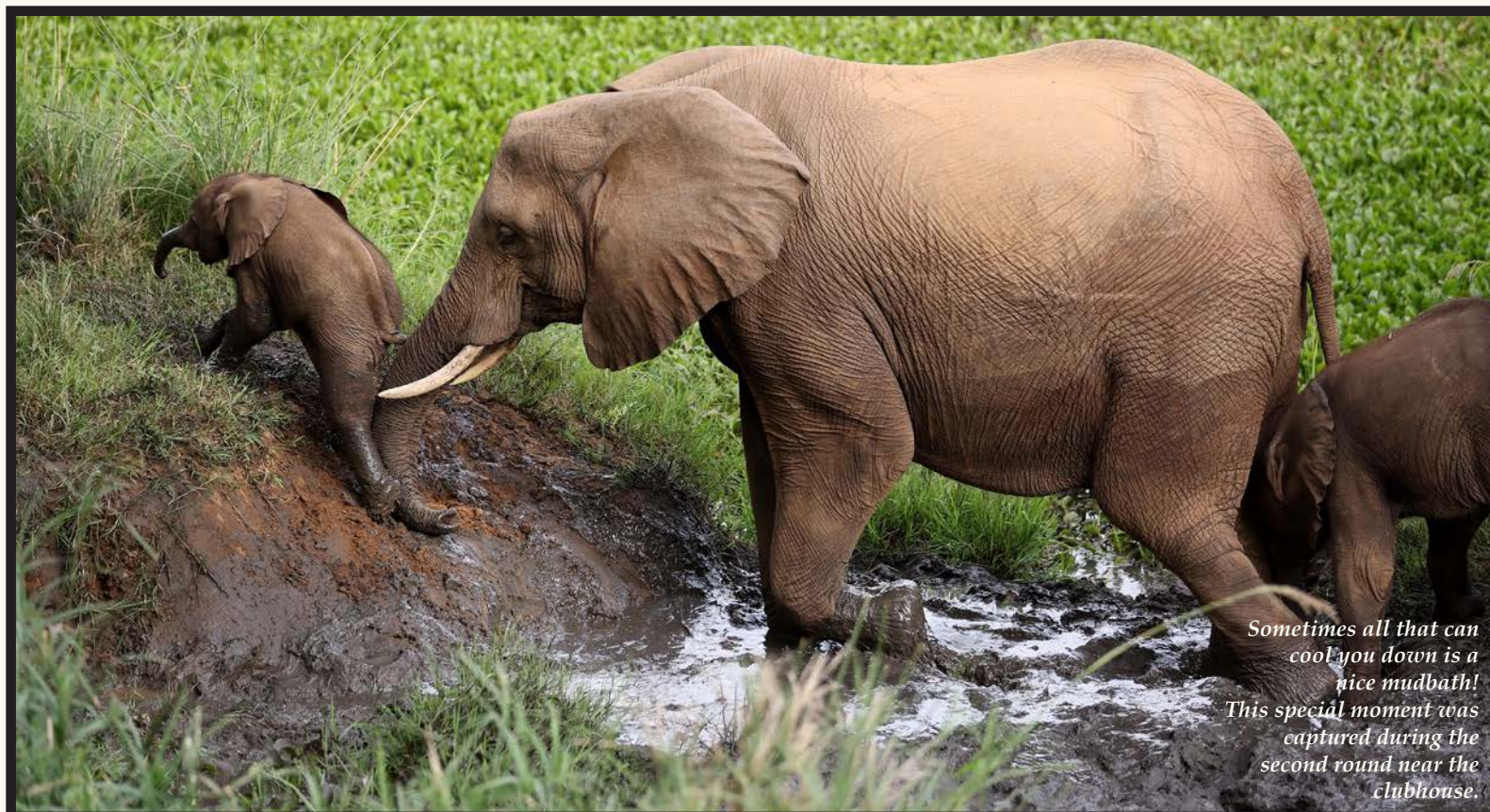
Sometimes all that can cool you down is a nice mudbath! This special moment was captured during the second round near the clubhouse.