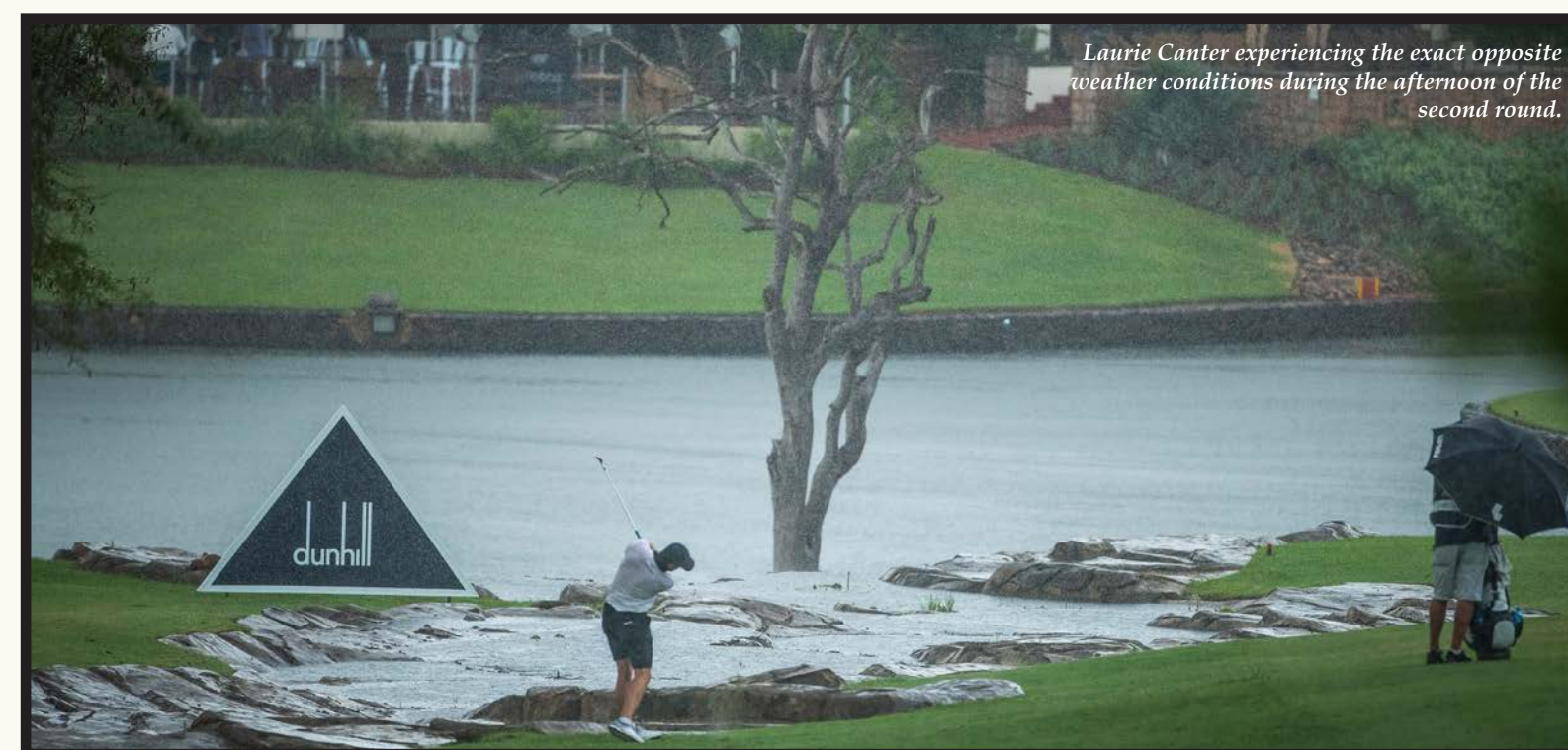
Laurie Canter experiencing the exact opposite weather conditions during the afternoon of the second round.