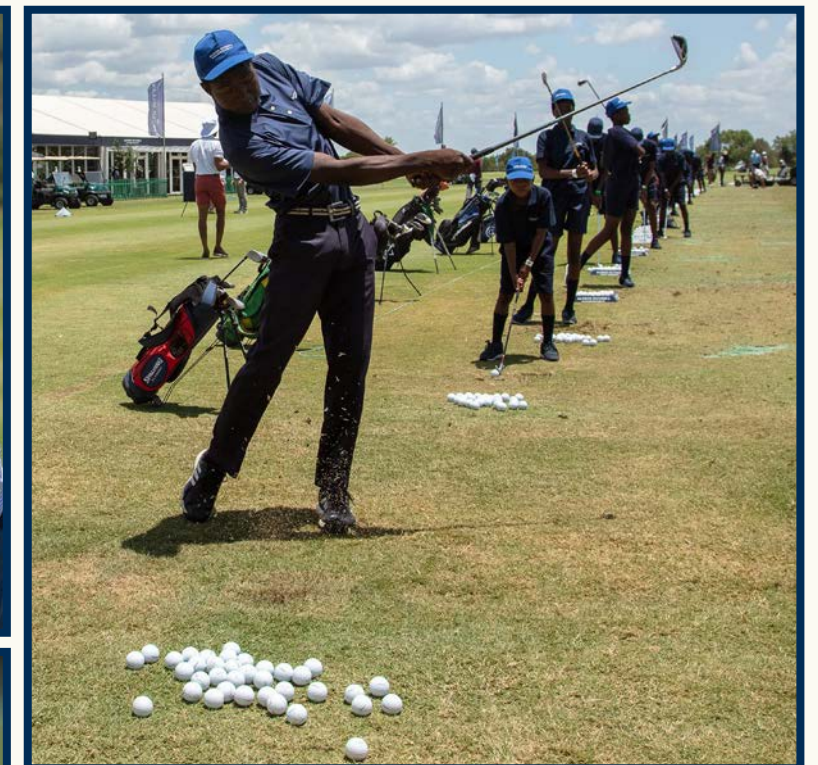
A passion for teaching, and playing the game.