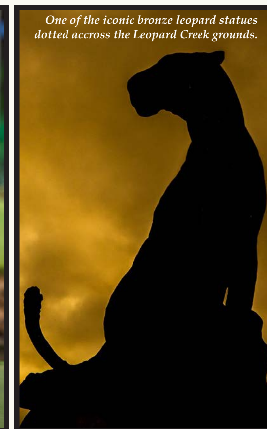
One of the iconic bronze leopard statues dotted accross the Leopard Creek grounds.