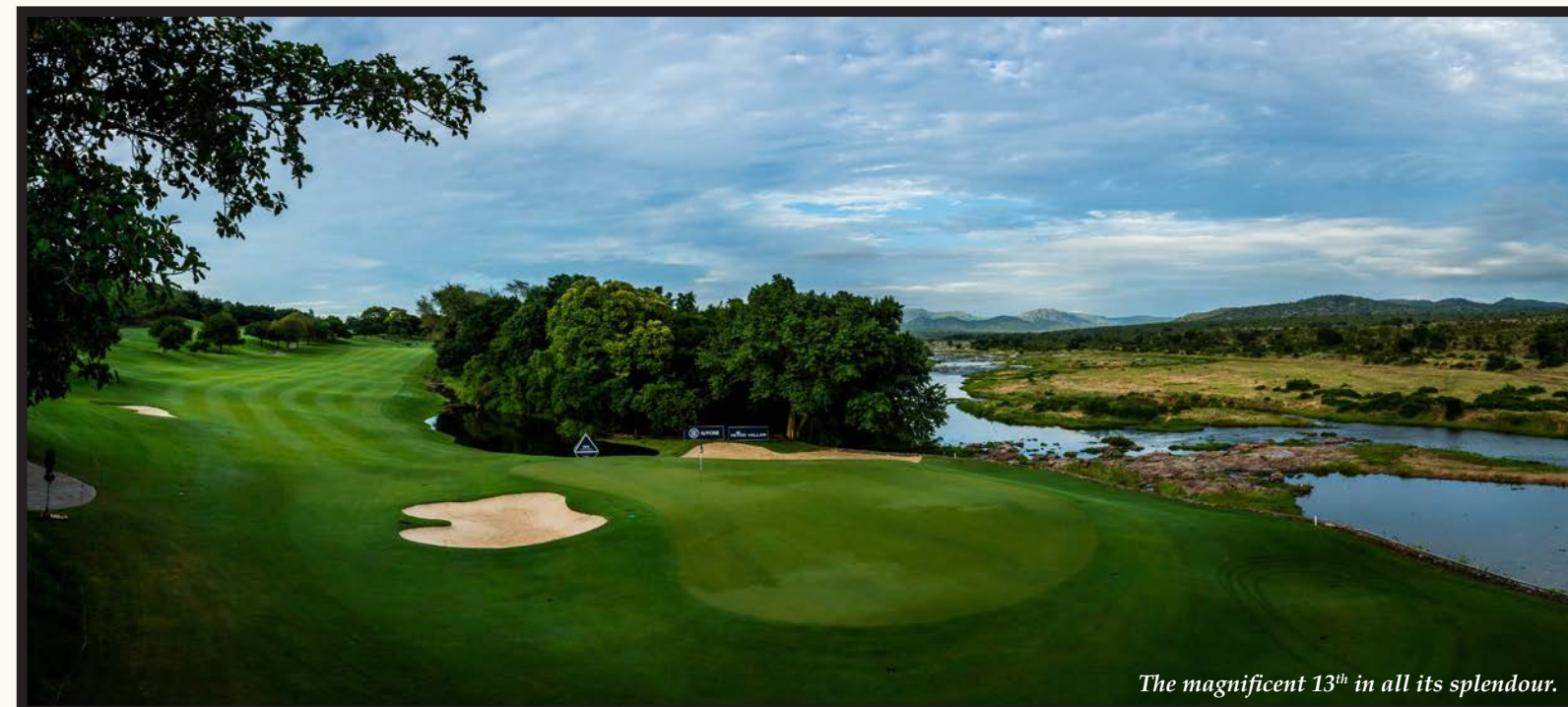
The magnificent 13 th in all its splendour.