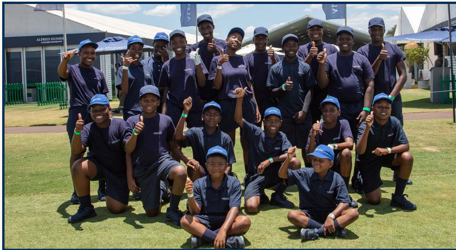
The development clinic during the Alfred Dunhill Championship is an invaluable experience for the children and professional golfers.