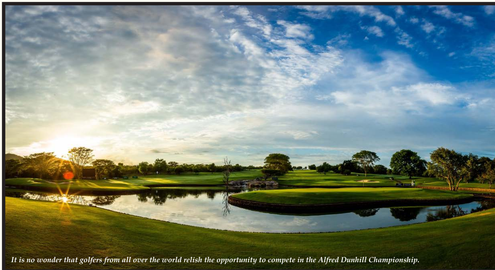
It is no wonder that golfers from all over the world relish the opportunity to compete in the Alfred Dunhill Championship.