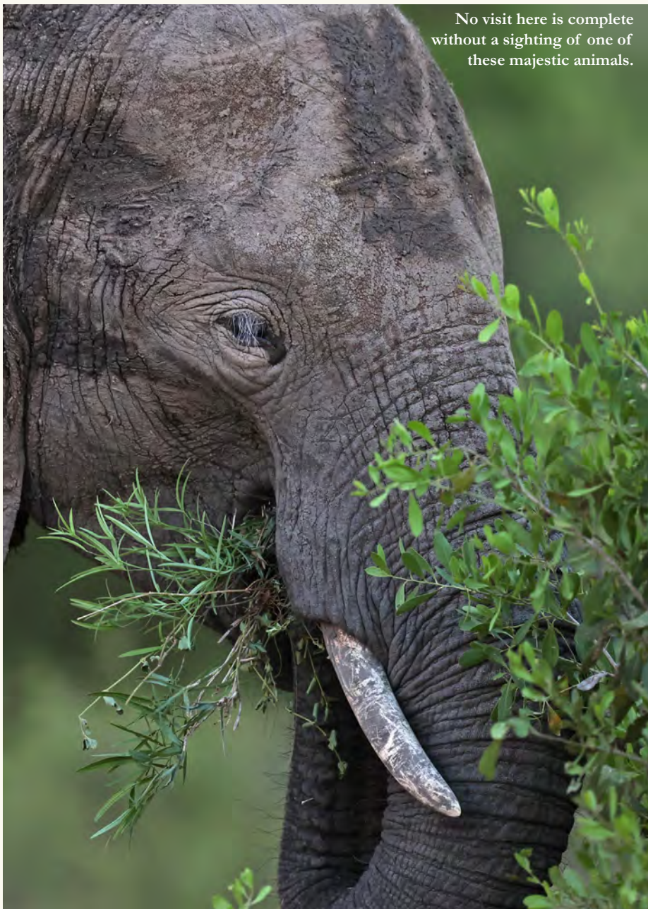
No visit here is complete without a sighting of one of these majestic animals.