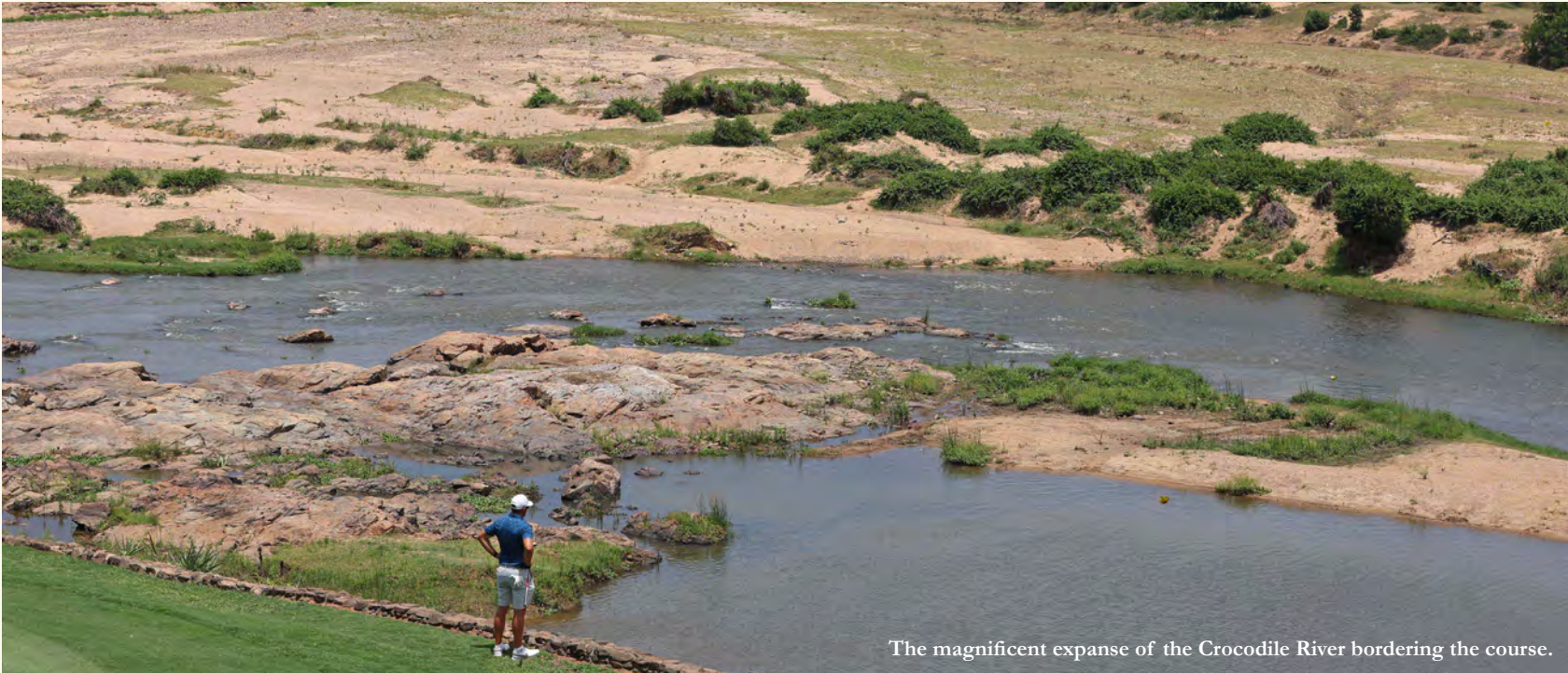
The magnificent expanse of the Crocodile River bordering the course.