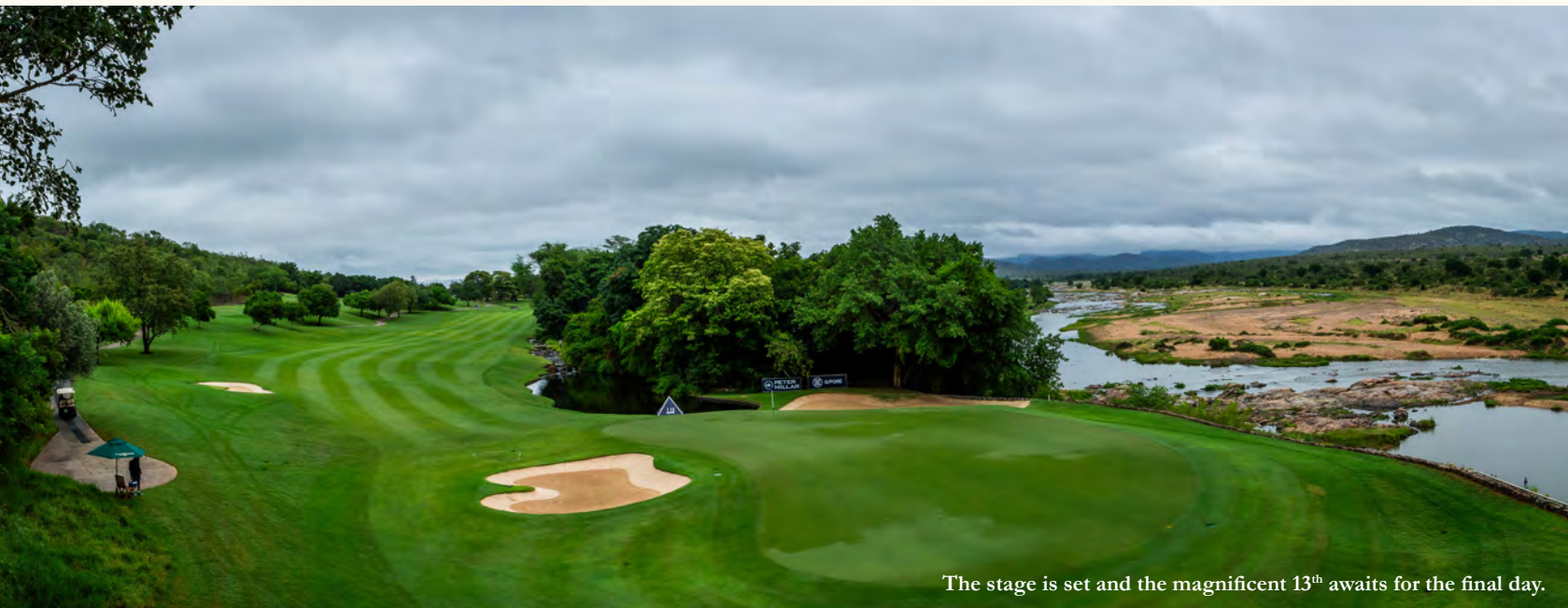
The stage is set and the magnificent 13 th awaits for the final day.