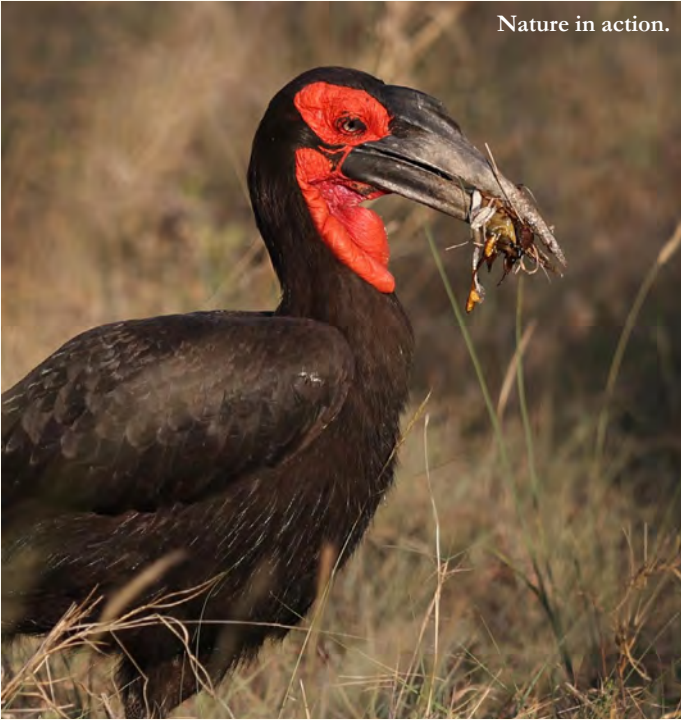
Nature in action.