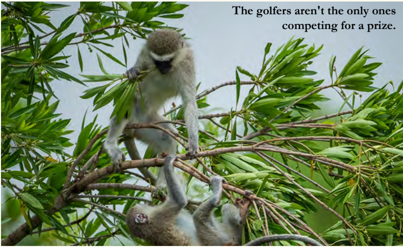
The golfers aren't the only ones competing for a prize.