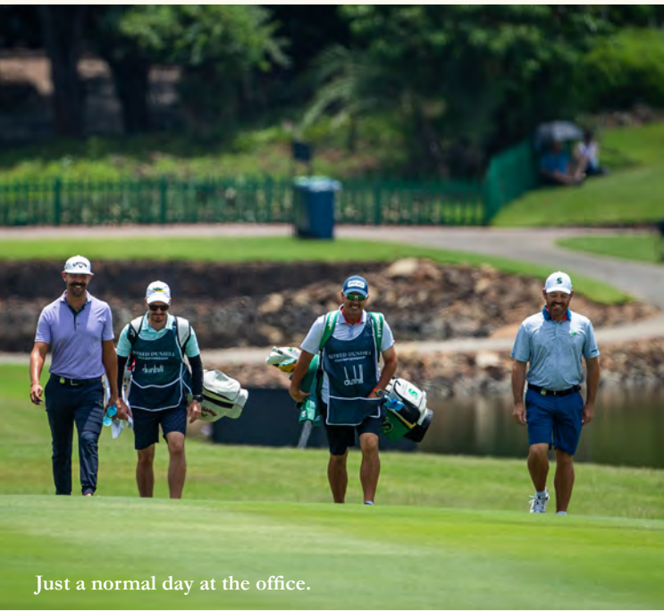
Just a normal day at the office.