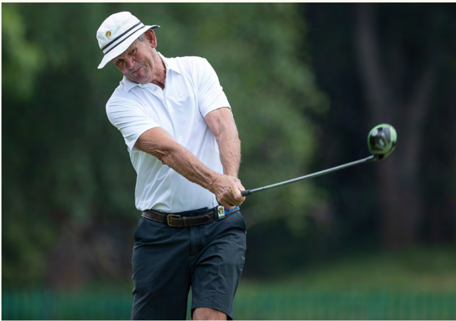
Springbok rugby legend Morné du Plessis was one of the pro-am guests.