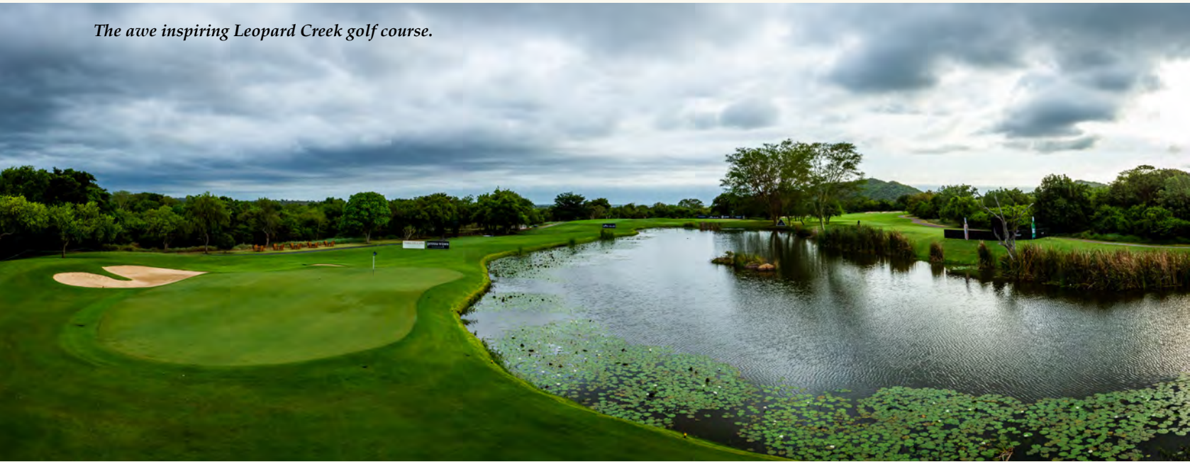
The awe inspiring Leopard Creek golf course.