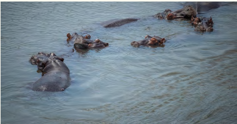
The hippos in the Crocodile River are already trying to get the best view of the golf.