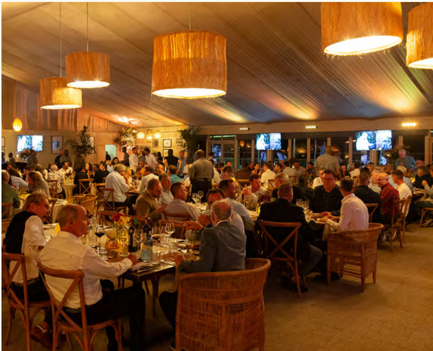
The pro-am prizegiving dinner set the tone for a week of magic at Leopard Creek.