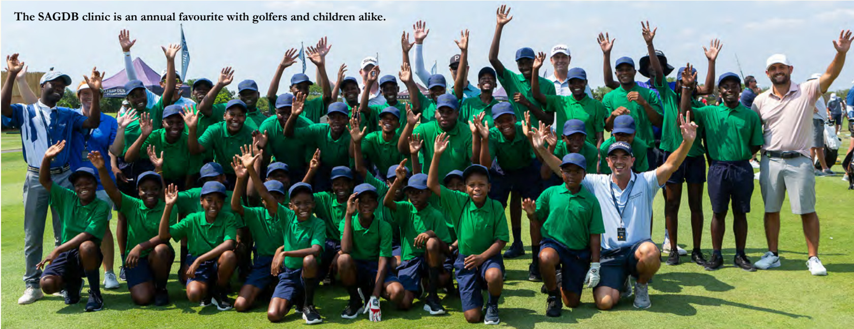
The SAGDB clinic is an annual favourite with golfers and children alike.