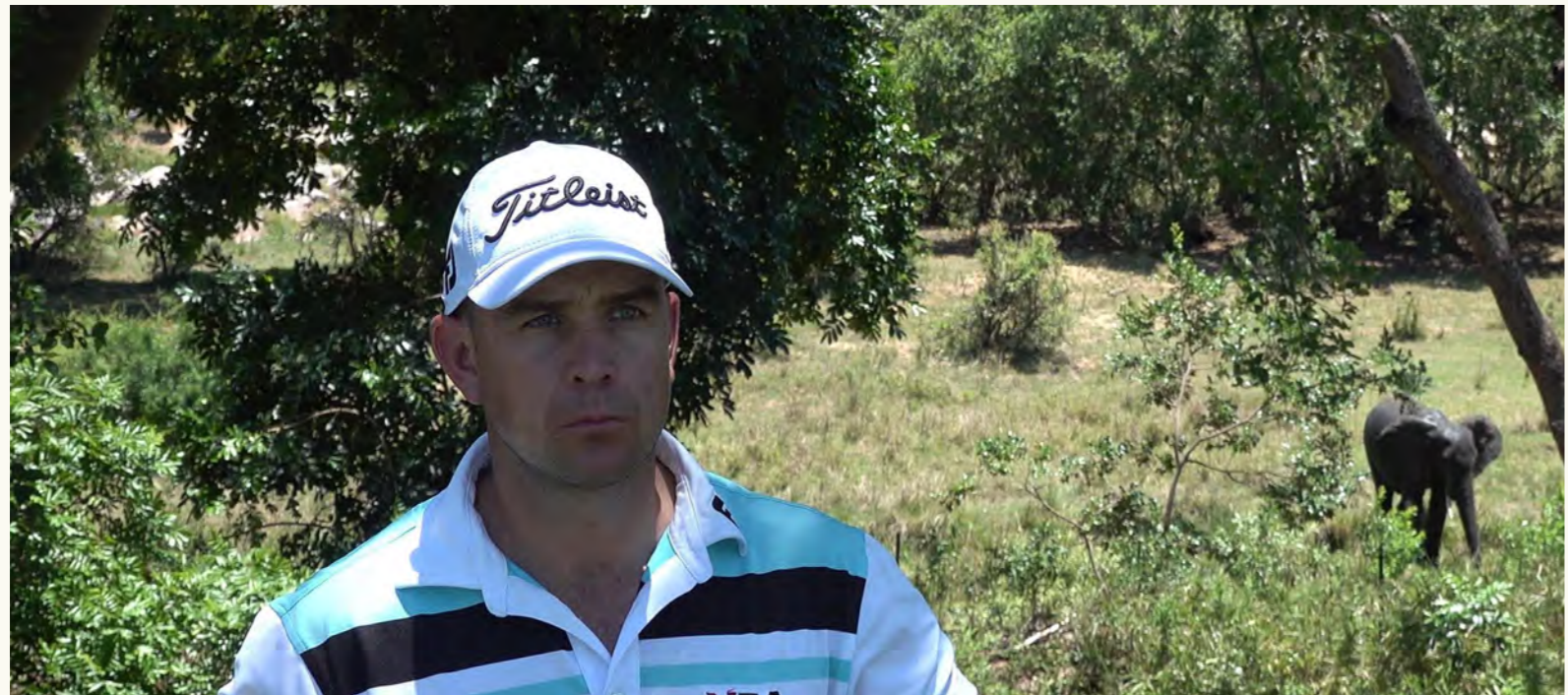
A few interesting fans sometimes listen in on the player interviews at Leopard Creek.