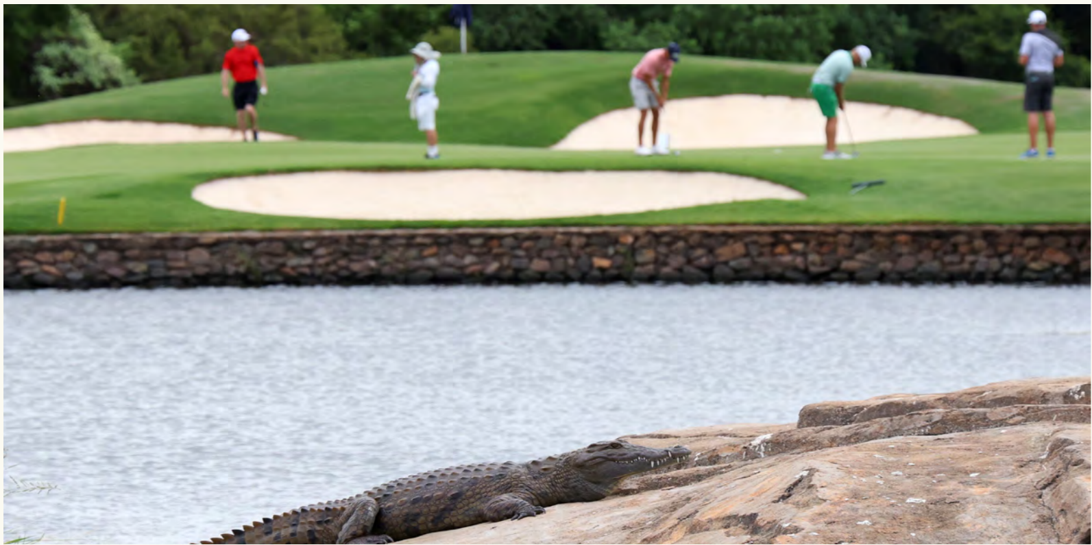
A new tournament week brings with it new challenges for the professionals.