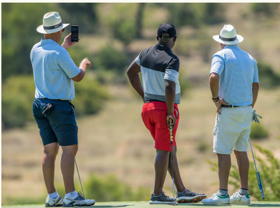
A pro-am pause to take in the beauty of the Kruger National Park.