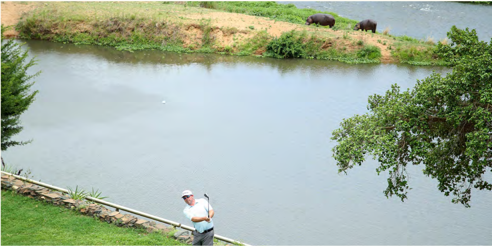
Justin Walters with a few chip shots in front of the most unique gallery in golf.