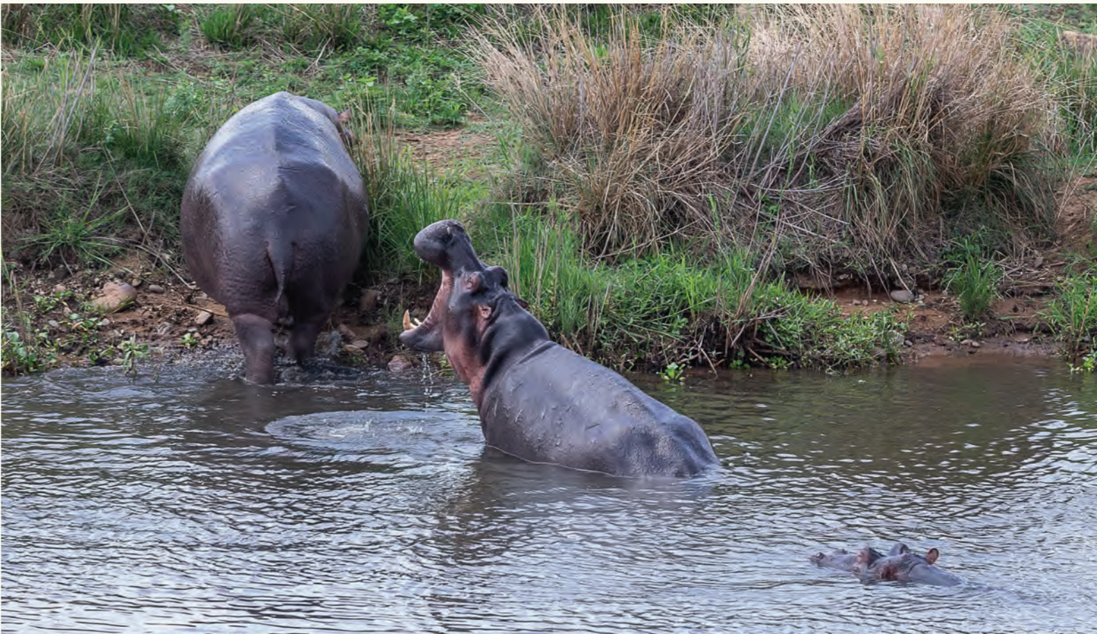
TOP: Nobody likes to be stuck behind a slow player.